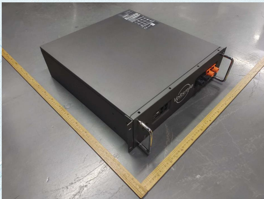
Figure 1 Front view of battery