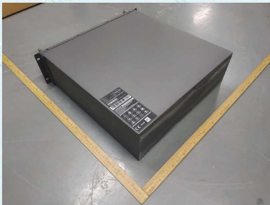
Figure 2 Back view of battery