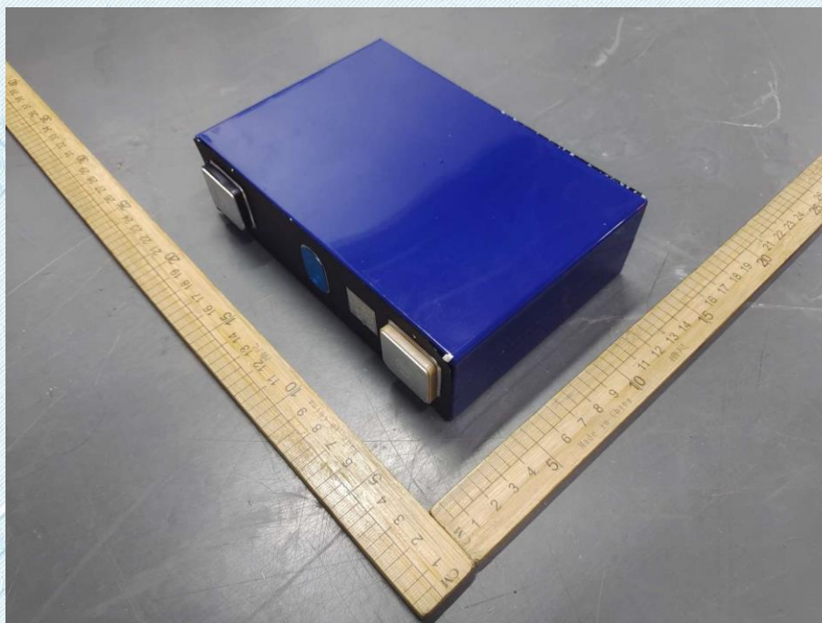
Figure 3 Front view of cell